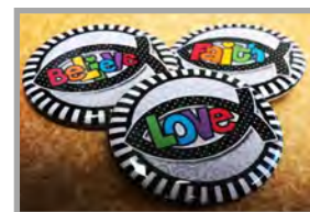
Backpack pins from a previous year

Can't make it? That is okay! We will leave blessed buttons in the Clinton side entrance for pick up starting Monday, August 24. The entrance will be open Monday- Thursday 8 am- 4 pm and Friday 8 am-noon.