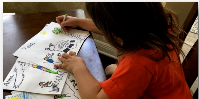
Children are also encouraged to write or send a drawing!

Tidings article deadline for May 2020 issue: April 20, 2020